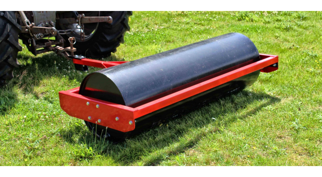
First published: May 2021